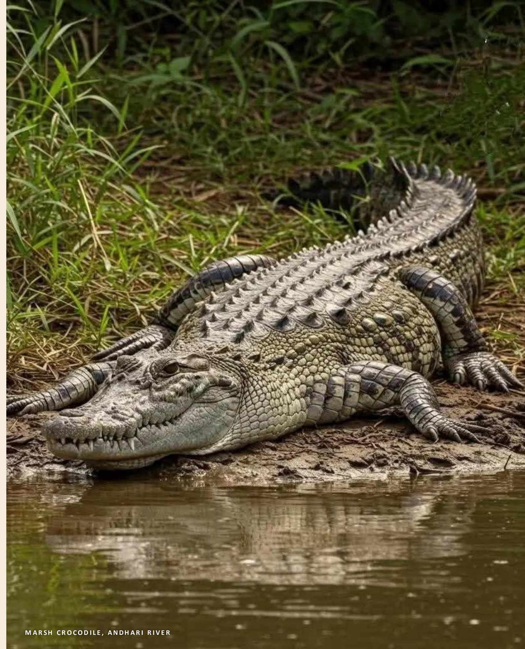
MARSH CROCODILE, ANDHARI RIVER

Since Kolsa village was relocated from the Zari Gate, tiger sightings have risen sharply.