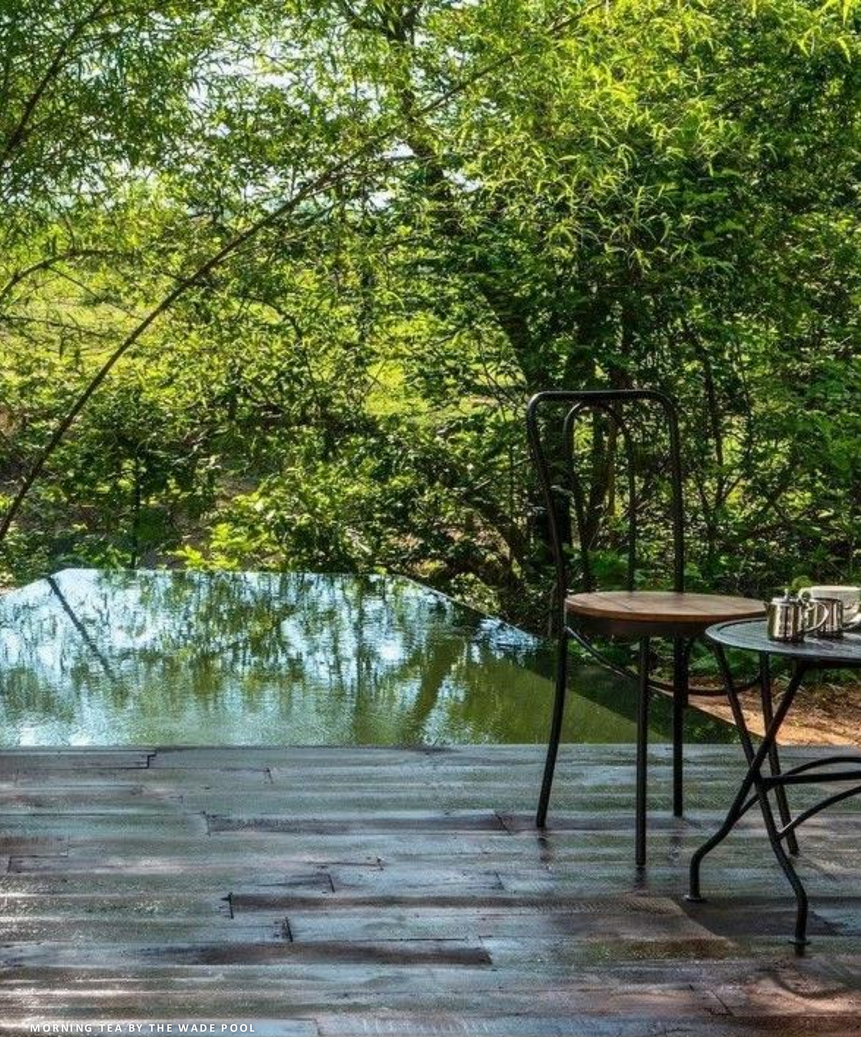
MORNING TEA BY THE WADE POOL