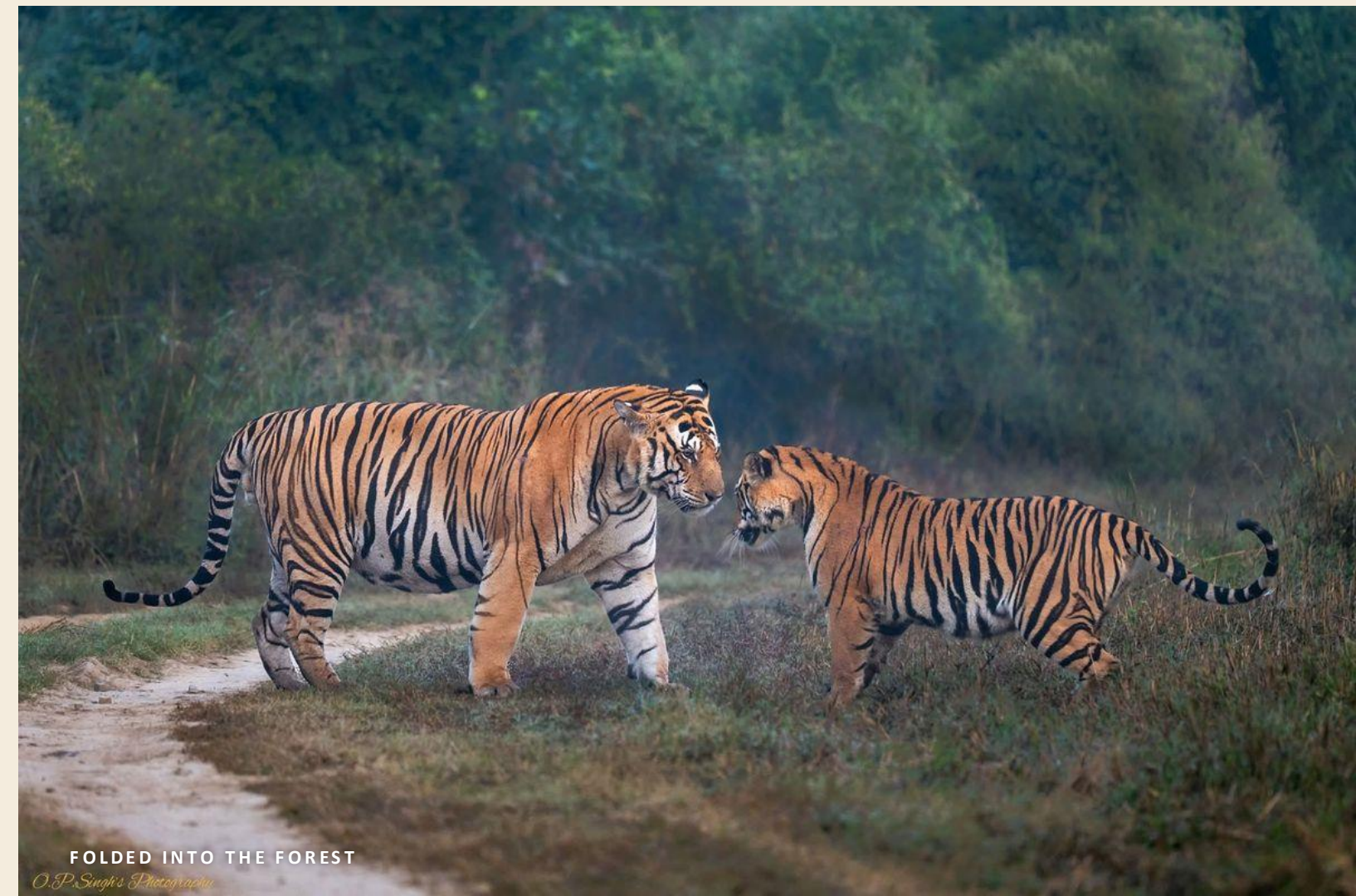
FOLDED INTO THE FOREST