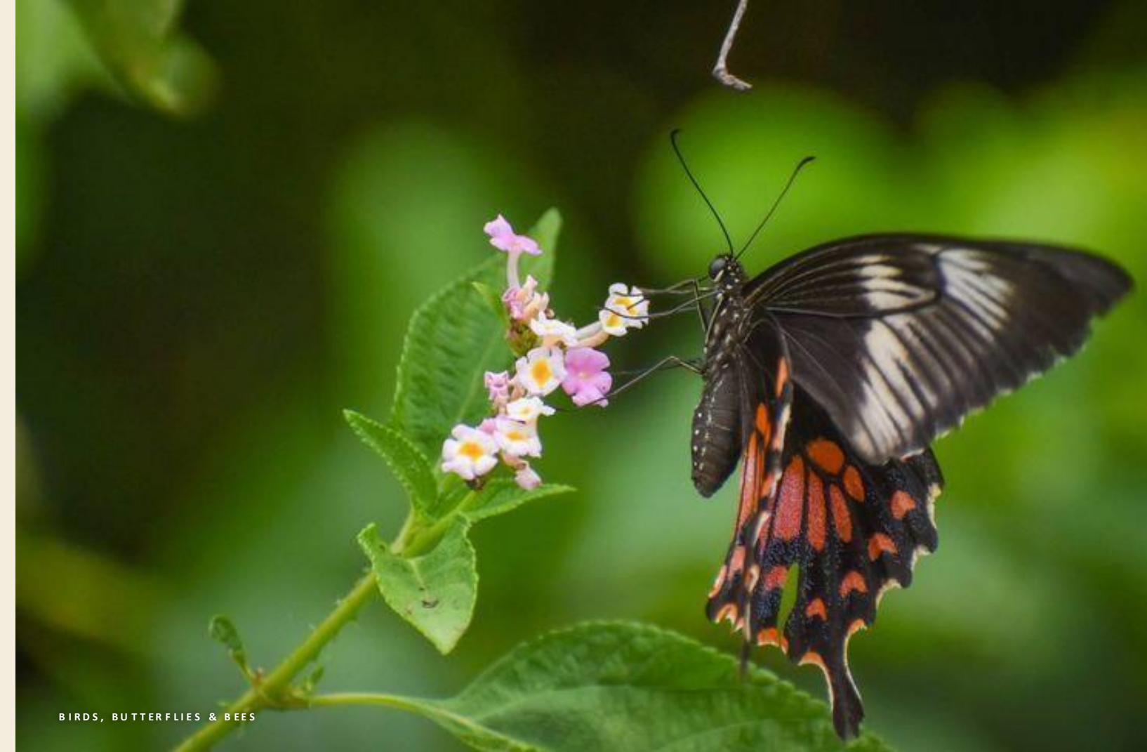
BIRDS, BUTTERFLIES & BEES